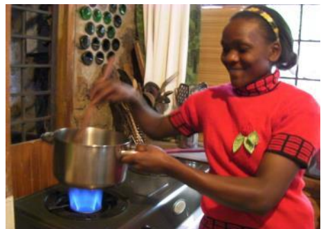
Clean, Green, Serene