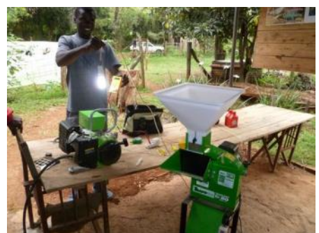
Generator, Chaff cutter etc

Larger capacity systems will produce sufficient gas to run machinery such as chaff cutters, water pumps, generators, etc improving efficiency, productivity and quality of the daily chores on the typical small-scale farms.