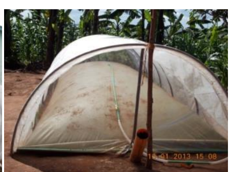
Operation within 7 – 10 days

The systems are fabricated from specially treated robust materials designed to withstand all weather conditions. The fabric is manufactured to last over ten years, and we further enhance its lifespan can be enhanced by applying a sunscreen UV block solution every seven years. We further enhance the lifespan by housing the system in a Micro-greenhouse tunnel that not only shields the digester against the harmful effects of direct solar UV rays, but also enhances and maintain high temperatures that increase the fermentation process and hence delivering unmatched efficiency and performance.