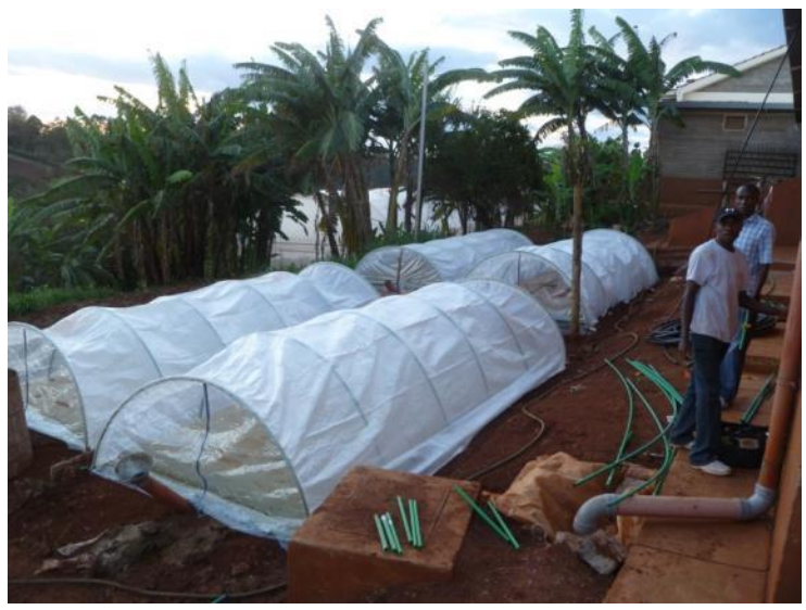
Institutional and large scale capacity – the sky ...