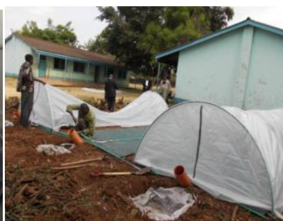
Assembly - only 1 day