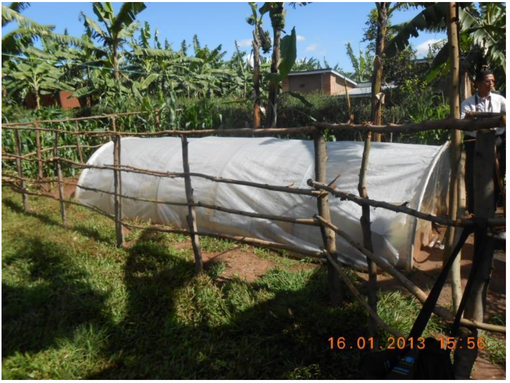
Rural Domestic Total Energy Solutions