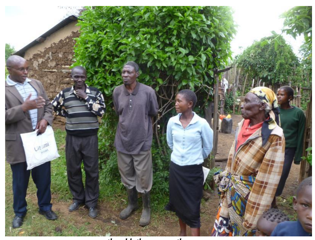
... the old, the young, the everyone

Upon installation, we further train the users on how to run and maintain the system, what does and what doesn't, troubleshooting the system and how to solve hitches. We are also available 24/7 to offer technical support to all our clients via mobile phone and email.