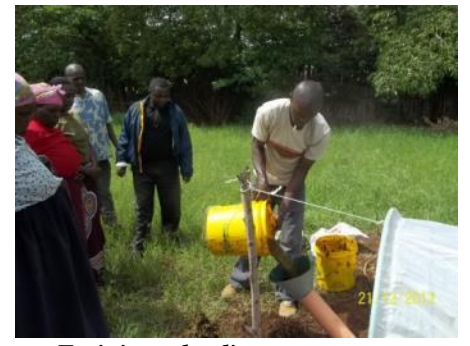
Training - loading