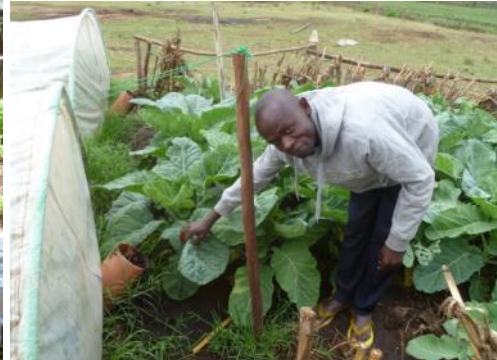
Flexi biogas = Food security