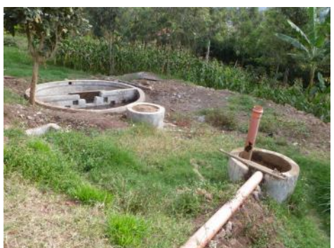
... look familiar??? (Abandoned failed conventional systems)