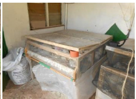
Biogas Chick Brooding