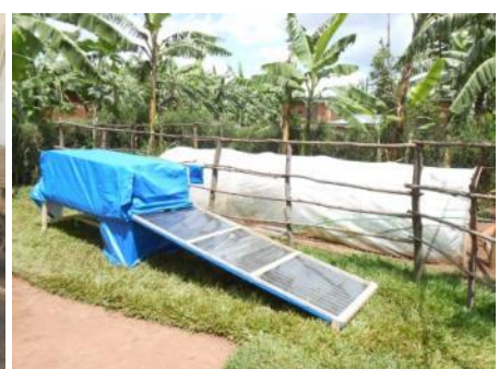
Biogas-Solar Combo Dehydration