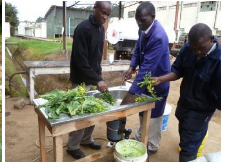
Anything Bio-degradable goes - Animal waste, Garden weeds, Kitchen and market waste, Water hyacinth, Mathenge, ... etc