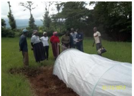
- "what to" & "what not to"